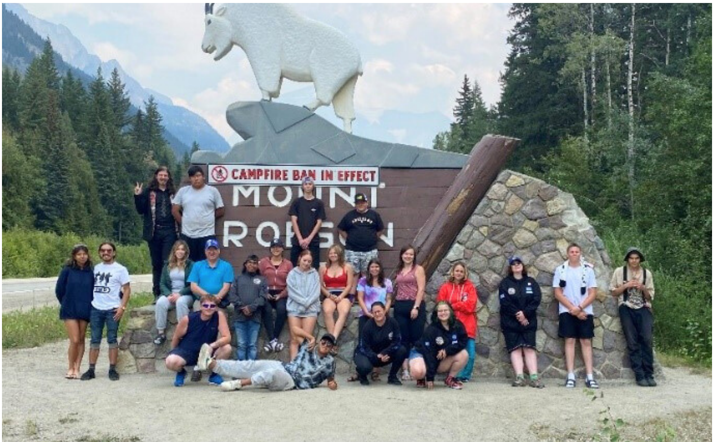
Lii Michif Otipemisiwak Family & Community Services - Kiikew Keur Program